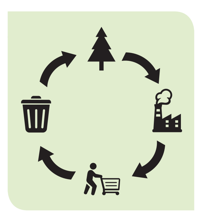
All Nordic Ecolabelling's criteria are rooted in a life cycle perspective.

New chemicals that are harmful to human health and the environment are constantly being discovered. At the same time, we still lack sufficient knowledge to be able to identify which particular characteristics of these chemicals and pollutants are having a harmful effect on our health and the environment. The effects are therefore difficult to assess. The majority of substances harmful to the environment being discovered today, are substances that break down slowly and are therefore found in the environment, foodstuffs and also in our bodies. Point sources of pollution, where chemicals are emitted in a more or less controlled manner, have been remedied over time. The most important source today