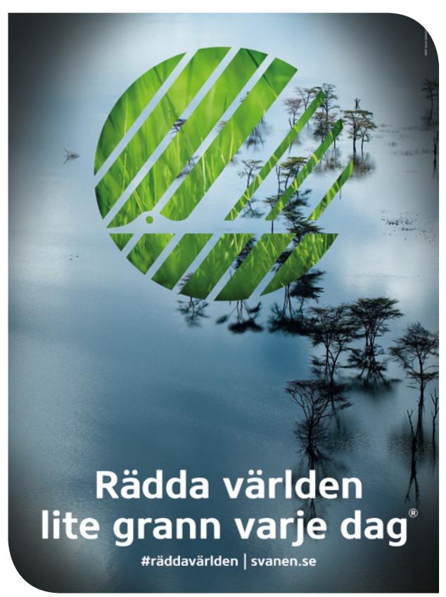
Swedish consumer campaign "Save the world a little bit every day"

become a strong symbol of consumer empowerment and environmentally friendly choices, were widely shown on national outdoor advertising, print ads in newspapers and magazines and online banners. Social media activation ensured high level of engagement from consumers. A majority of Danish supermarket chains participated in the two campaigns with offers on ecolabelled products and visibility in store, in trade papers and social media. Both campaigns were supported by extensive PR activation, which resulted in more than 160 press clippings from licensees, retail, stakeholders, authorities and national news media. Follow-up consumer research showed both a significant increase in unaided awareness of the Nordic Swan Ecolabel, and an increase in share of consumers looking for the Nordic Swan Ecolabel when purchasing. Awareness of the EU-Ecolabel grew from 38% (2015) to 44% (end of 2016).