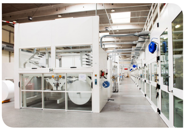
Abena's production plant.

There is also the task of making international customers understand what the Nordic Swan Ecolabel actually represents. We think that this is a story that needs telling and we would like to work alongside Nordic Ecolabelling to help improve this knowledge. Greater international focus is required. The label needs to be recognized outside the Nordic region and its value needs to be clear.