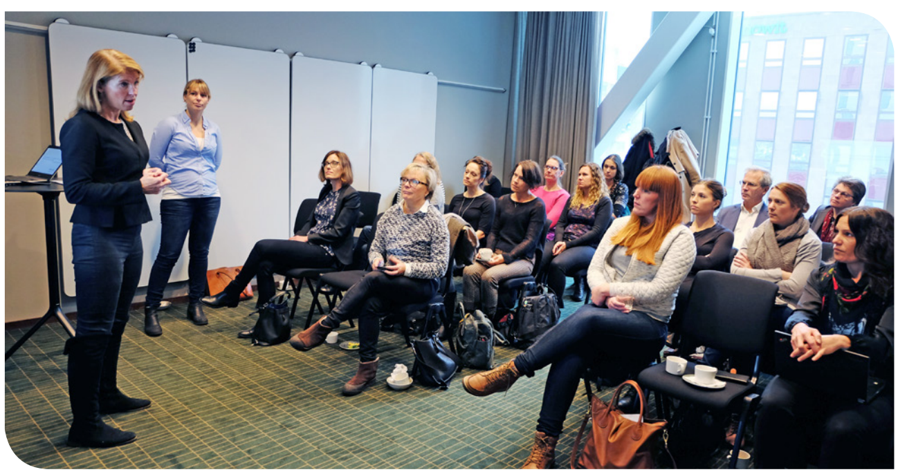
The Nordic Swan Sustainable Procurement Network holds many seminars to provide the opportunity for knowledge sharing on environmental and other sustainability issues.

The advertising campaign with the overriding message "Save the world a little every day" continued in Sweden, Norway and Finland. In Sweden there was an outdoor advertising in 34 cities at bus stops and underground stations, ads in major country-wide newspapers, followed by the digital campaign "The world's most important classroom" where celebrities gave a 3 minute speech in a classroom setting about what sustainability means to them. Ecolabelling Norway also ran an outdoor campaign in 40 cities and suburbs, digital ads at 55 shopping centres as well as ads in magazines and newspapers. In addition to this, the campaign provided