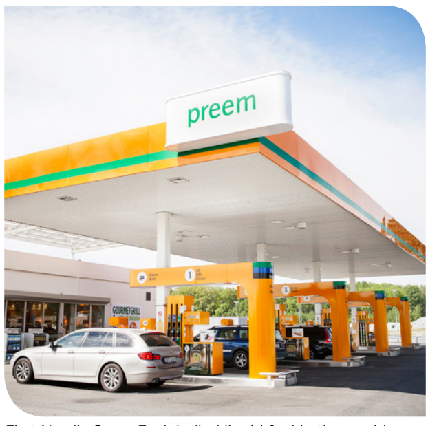
First Nordic Swan Ecolabelled liquid fuel in the world.

Absolutely, from both private consumers as well as our B2B customers. Most people want to choose what is best for the environment, and the Nordic Swan Ecolabel is instant proof of our product being the right choice. The Nordic Swan Ecolabel facilitates both for us and for our conscious customers.