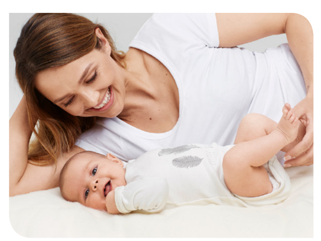
Cubus Nordic Swan Ecolabelled baby collection.

We sincerely hope so. Cubus has been making a great deal of green choices for a very long time, working with a substantial amount of Eco-Friendly cotton, BCI cotton etc. The Nordic Swan Ecolabel was an addition to and a way to highlight our sustainable effort, and we hope this will contribute to open the eyes of the customers on how we strive to do better for our planet.