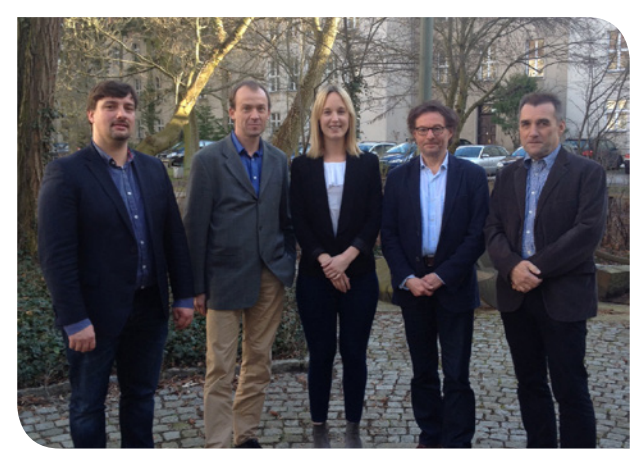
Nordic Ecolabelling in Berlin for a joint meeting with the Blue Angel.

In Denmark, the campaign "Your choice today makes a world of difference tomorrow" ran twice in February and October. The green shopping basket, which has