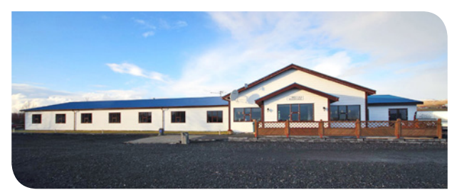
Hótel Fljótshlíð is a small hotel in rural Iceland.

We seem to have a new generation of tourists that put more emphasize on environmental issues and they demand to travel as green as possible. Today we are connected to foreign travel agencies that were specifically looking for hotels in Iceland that had an ecolabel so the licence really has paid off.