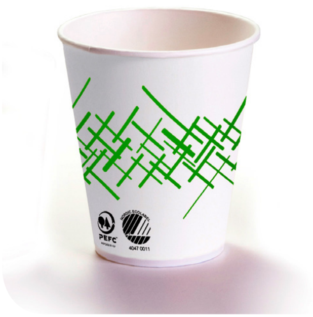
Huhtamäki's Nordic Swan Ecolabelled cup.

As the Nordic Swan Ecolabel is a well-known and trusted ecolabel, we believe it has a positive impact on end users. As a visual element on a product the Swan logo makes sustainable choice easier. This is one of the key benefits we offer to our customers.