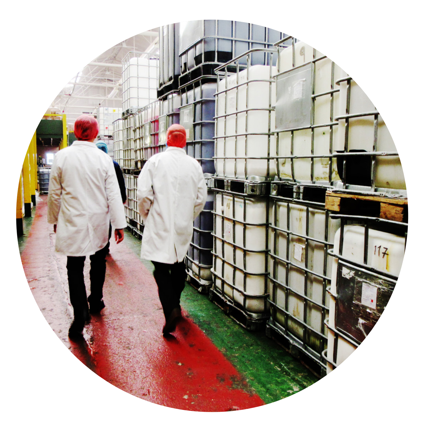
Nordic Ecolabelling regularly visits our licence holders for inspection.